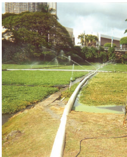
Fig. 1. In this field of water cress, the world’s biggest selling biopesticide, Bacillus thuringiensis (Bt) toxin, was overcome by the evolution of resistance in diamondback moths. This pesticide is engineered into millions of acres of crop plants, and so the ability of insects to evolve resistance has created anxiety in the biotechnology industry.