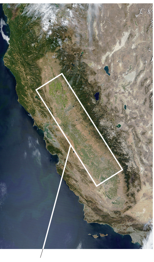
\label{eq:alpha} \begin{array}{l} \mathsf{A} \approx 300 \; km \times 100 \; km \\ \approx \mathsf{f} \times 10^{10} \; m^2 \end{array}