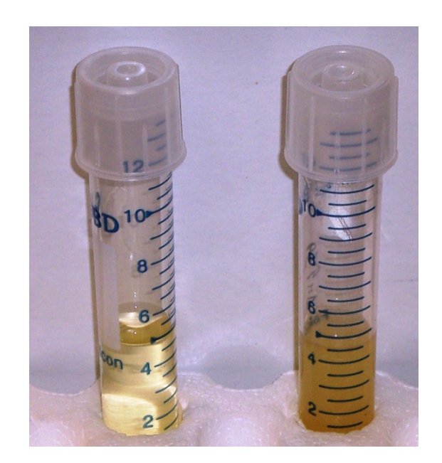
Figure 4: Growth of E. \ coli in rich media. The tube on the left shows roughly 5 mL of growth media just after inoculation. The tube on the right shows such media after saturation due to exponential cell growth and division.

doubled the number of occupants that can be fed on earth as a result of the Haber-Bosch process and the synthetic fixation of nitrogen. In this part of the problem, begin by estimating the number of kilograms of biomass per square meter that is produced per year. From that number, figure out how many kilograms of nitrogen are contained per square meter of biomass. Then, make an estimate of how much fertilizer is used for each square meter and hence for the entirety of the Central Valley.